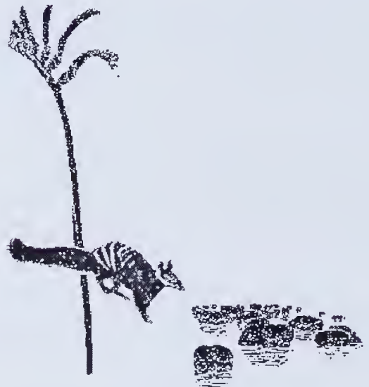
Figure 8. Emblem of the Journal of the Royal Society of Western Australia (by J Taylor).